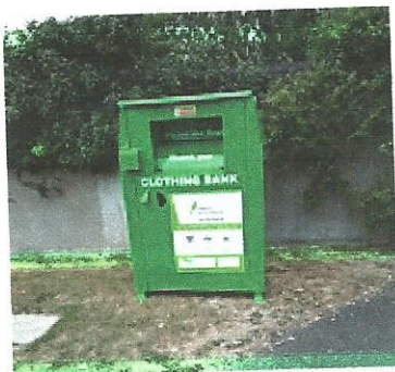
Green Bank.jpg 119K